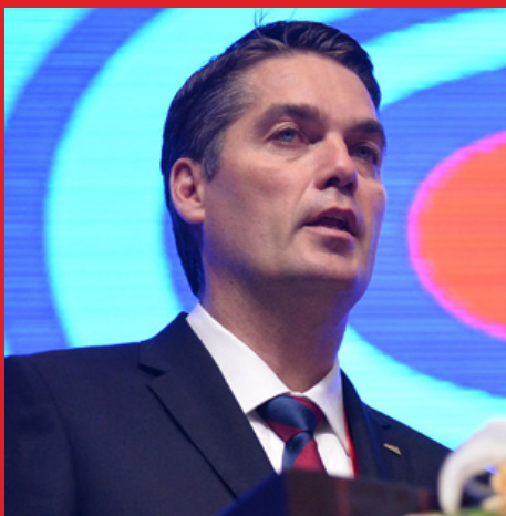
Poul-Erik Høyer BWF President