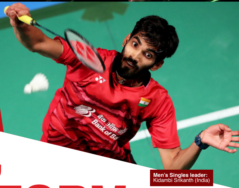
Men's Singles leader: Kidambi Srikanth (India)