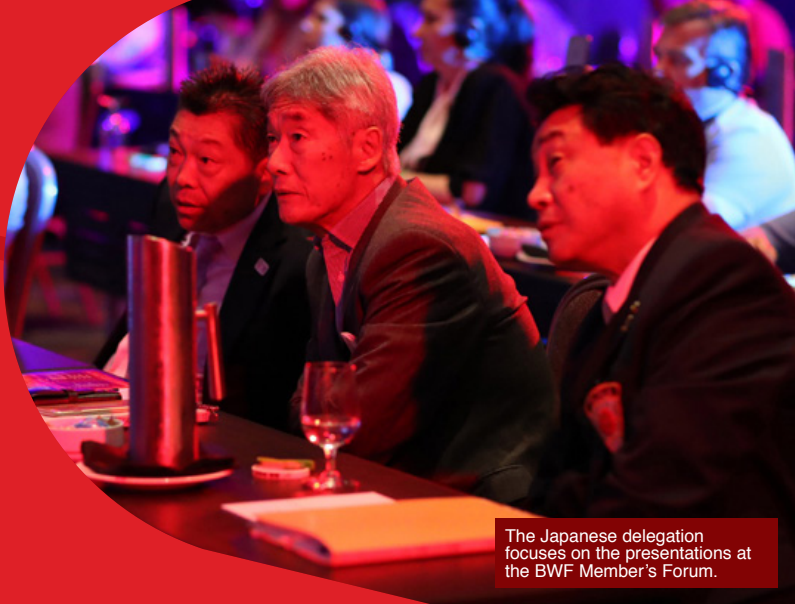
The Japanese delegation focuses on the presentations at the BWF Member's Forum.