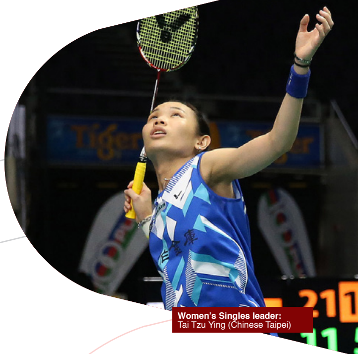
Women's Singles leader: Tai Tzu Ying (Chinese Taipei)