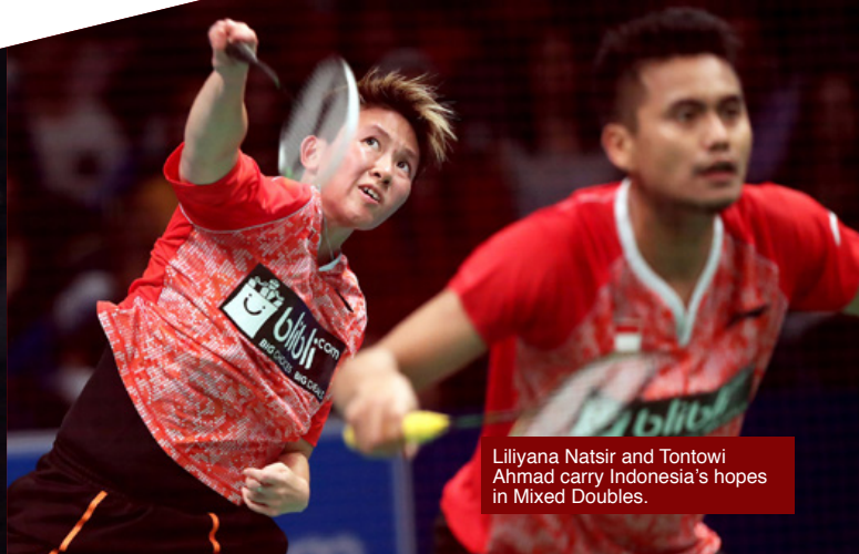
Liliyana Natsir and Tontowi Ahmad carry Indonesia's hopes in Mixed Doubles.