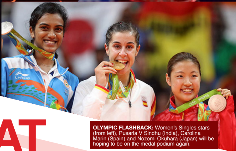
OLYMPIC FLASHBACK: Women's Singles stars (from left), Pusarla V Sindhu (India), Carolina Marin (Spain) and Nozomi Okuhara (Japan) will be hoping to be on the medal podium again.