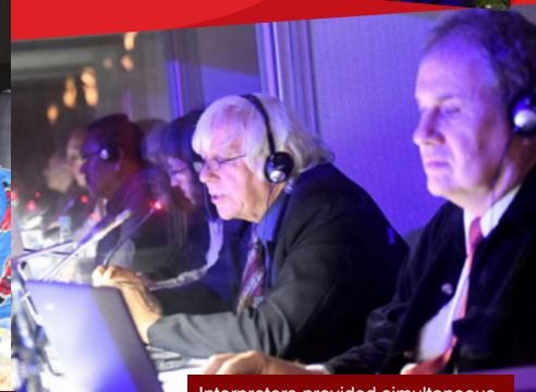
Interpreters provided simultaneous translation in Arabic, French, Russian and Spanish.