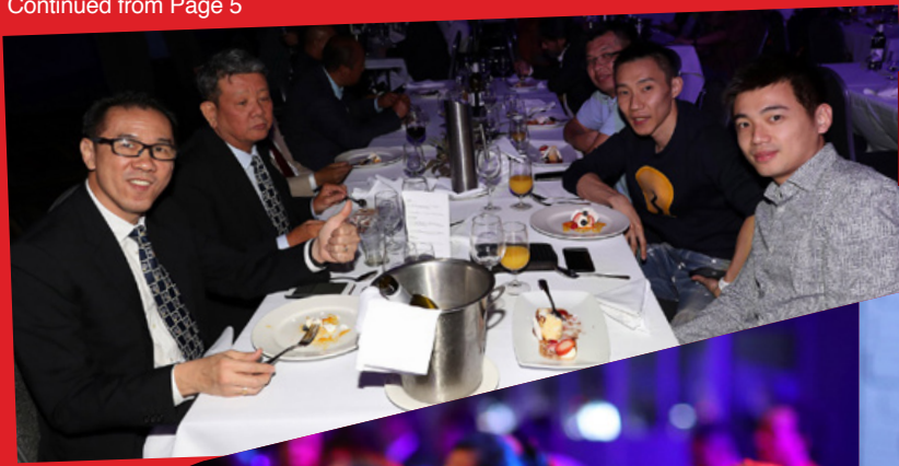
Team members and delegates from Malaysia, including star players Lee Chong Wei (second right) and Tan Wee Kiong (right), enjoying the Gala Dinner.